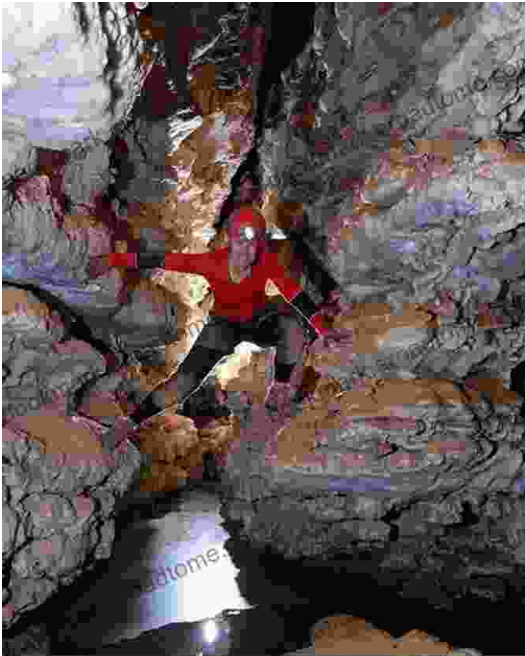
The Science Behind the Subterranean World