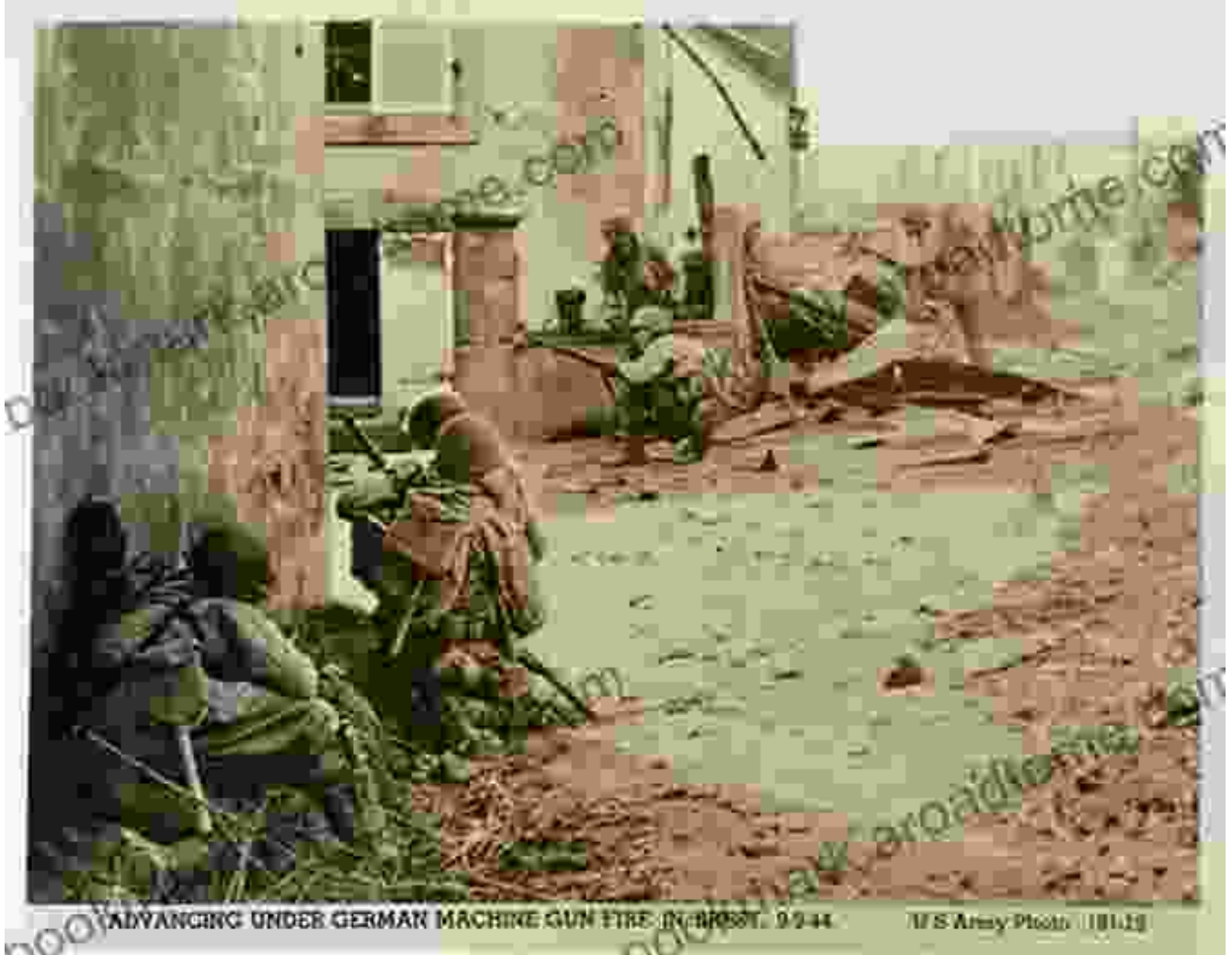
ADVANCING UNDER GERMAN MACHINE GUN FIRE IN BROUPEL, 6 JUNE 1944