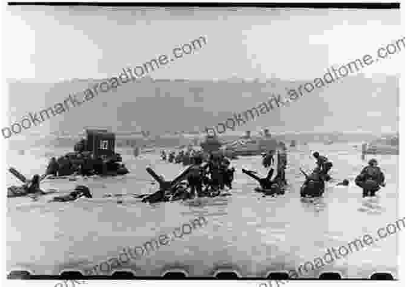
American soldiers advancing inland from Omaha Beach